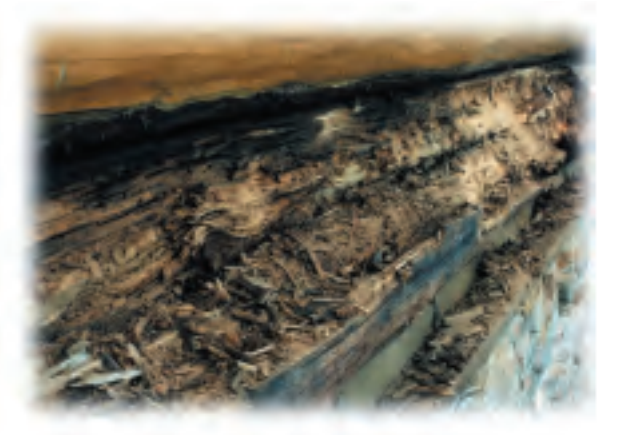
PeneTreat helps prevent damage before it starts.

According to the most comprehensive study available, the depth of penetration of PeneTreat is as deep or deeper than other borate products that use slow-drying and toxic solvents (like ethylene glycol) in their formulations. Contact Sashco at 1-800-767-5656 if you'd like a copy of this study.