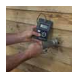
2 Optional: add mildewcide